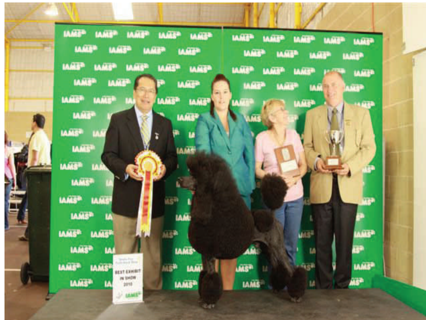
Best In Show 2010 Perth Royal Show - Ch. Tytaff Walk the Line